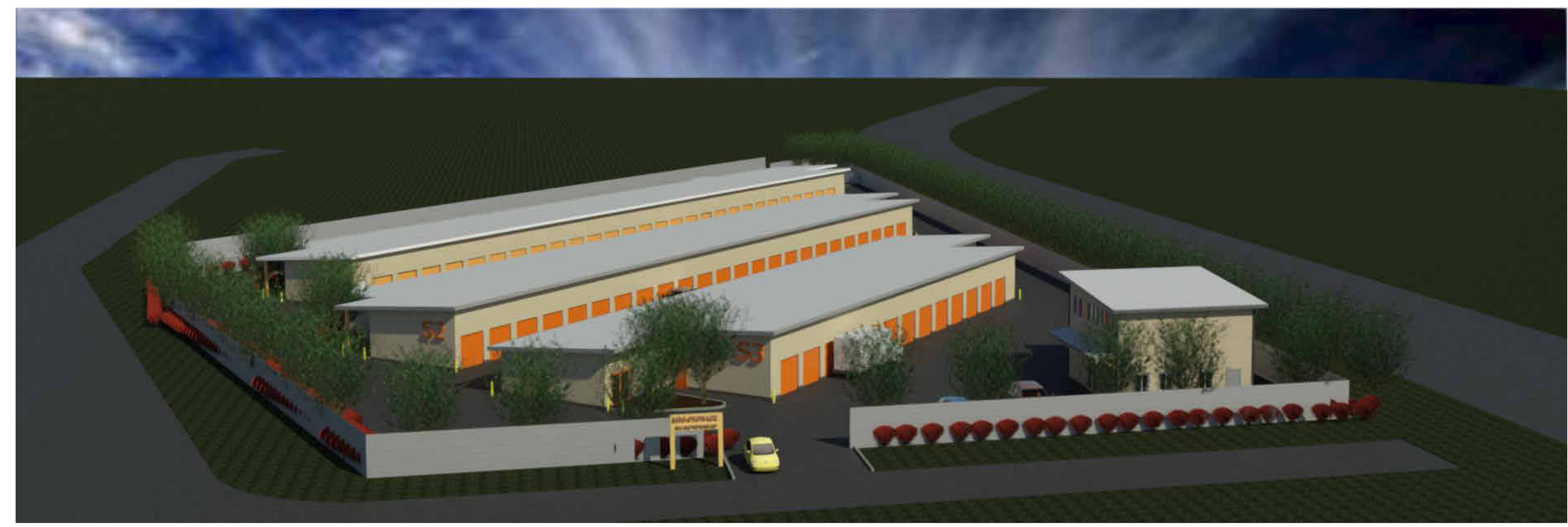
3D VIEW - LOOKING AT MELIDO ROAD ENTRANCE