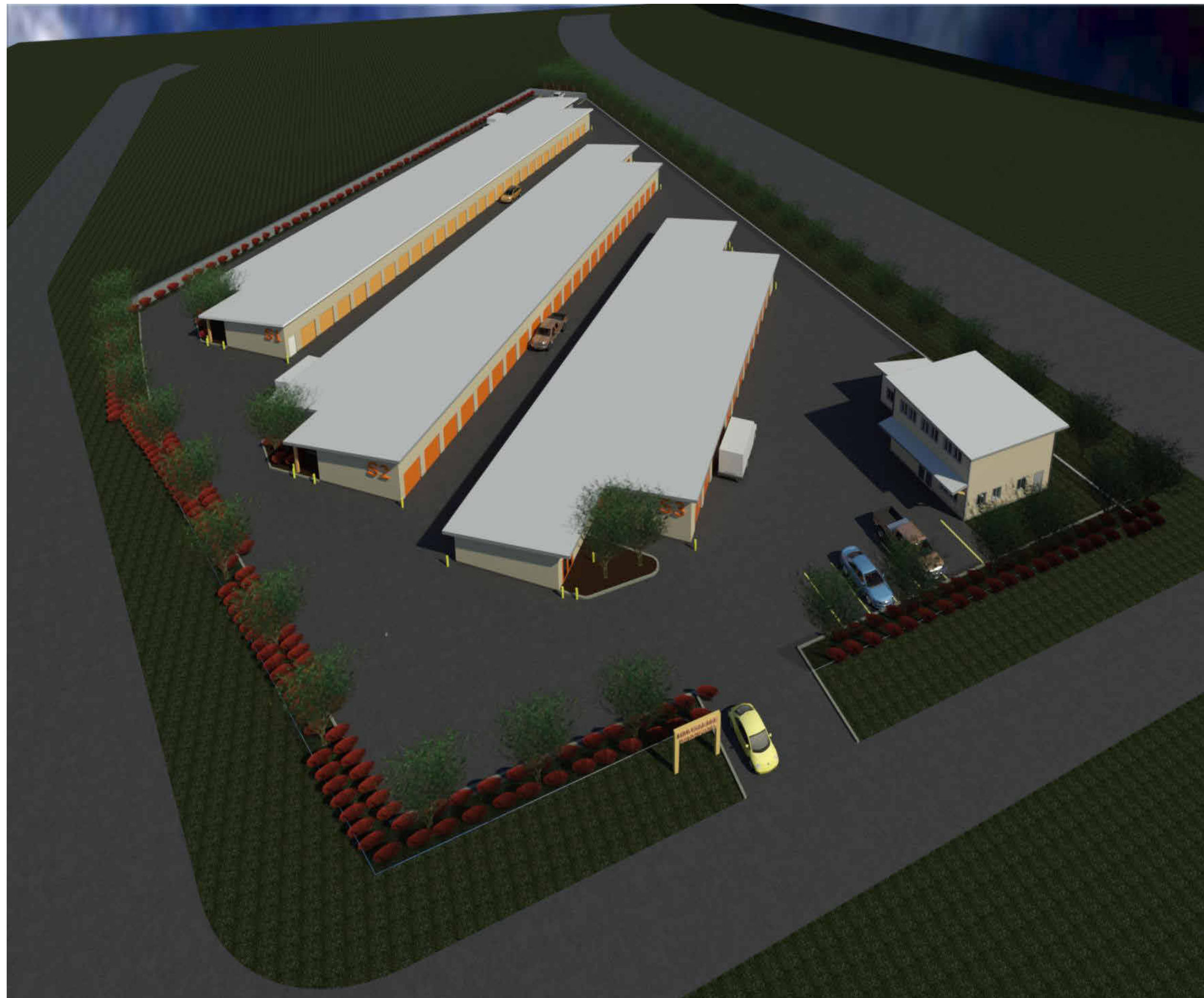
3D VIEW - AERIAL SITE VIEW AT MELIDEO ROAD ENTRANCE