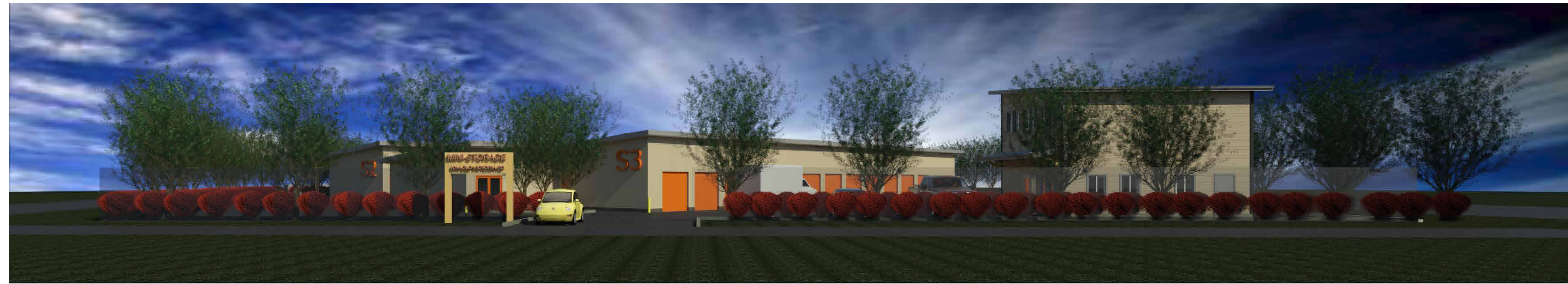
3D VIEW - LOOKING AT MELIDO ROAD ENTRANCE