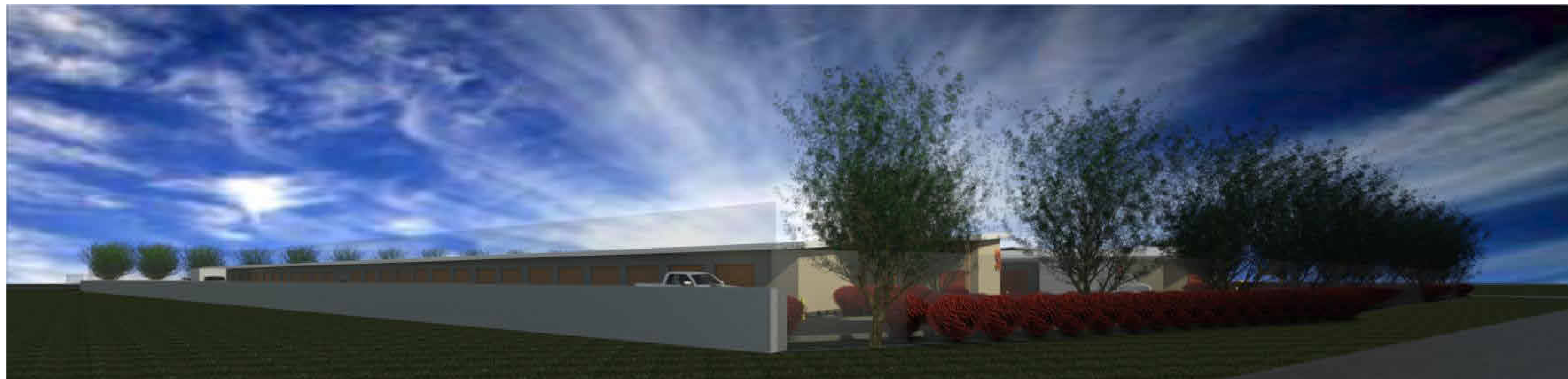
3D VIEW - FROM VICTORIA ROAD LOOKING SOUTHEAST