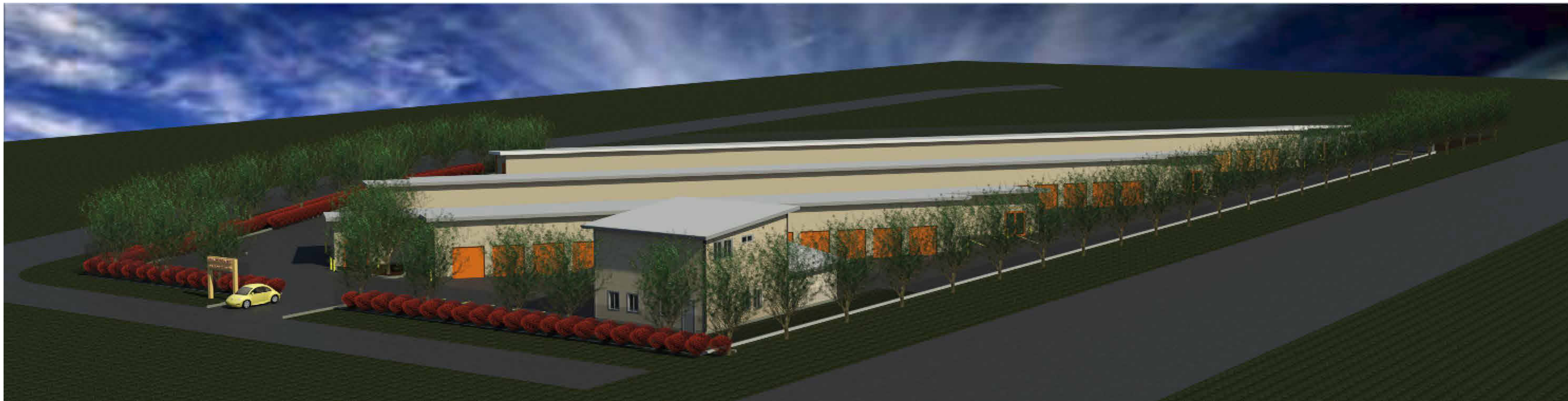
3D VIEW - LOOKING FROM HIGHWAY 1 / MELIDO ROAD WESTWARD