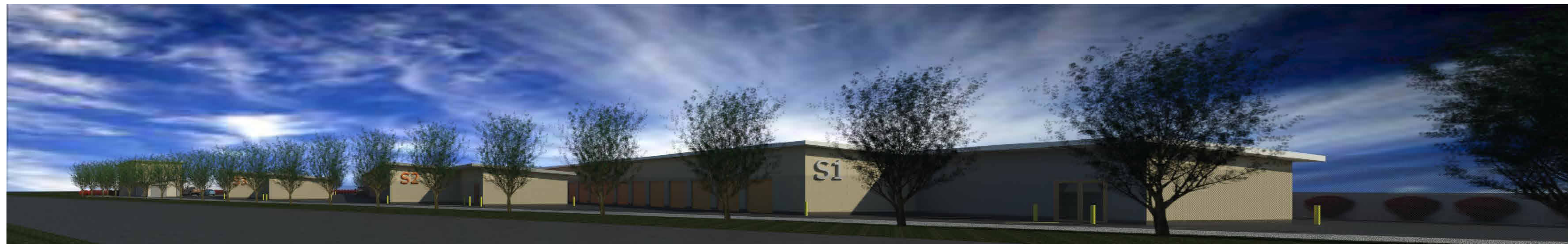
3D VIEW - LOOKING FROM HIGHWAY 1 SOUTHWARD