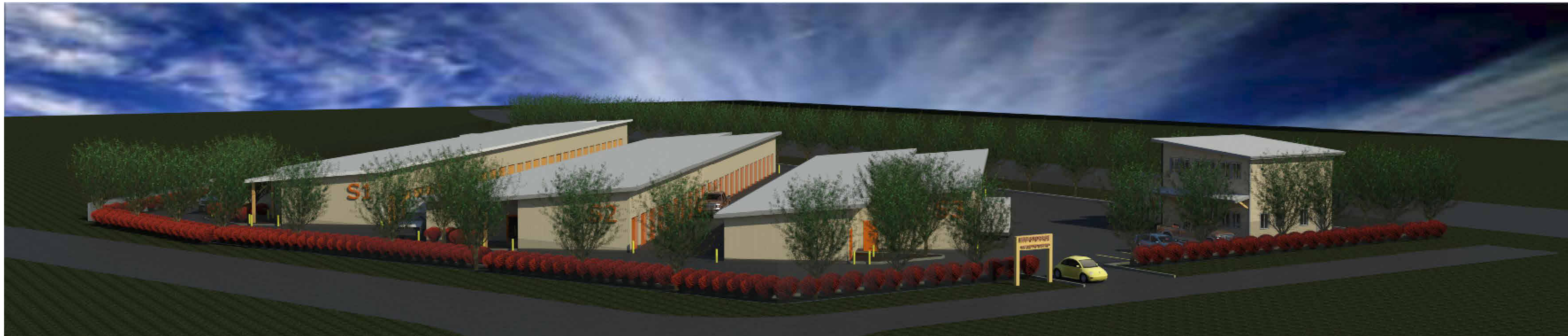
3D VIEW - LOOKING FROM OLD VICTORIA ROAD / MELIDO ROAD NORTHWARDS